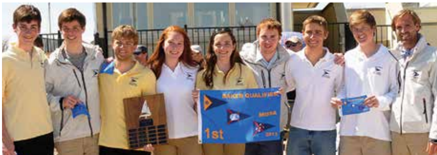
Winners of the Baker High School Regional Qualifier